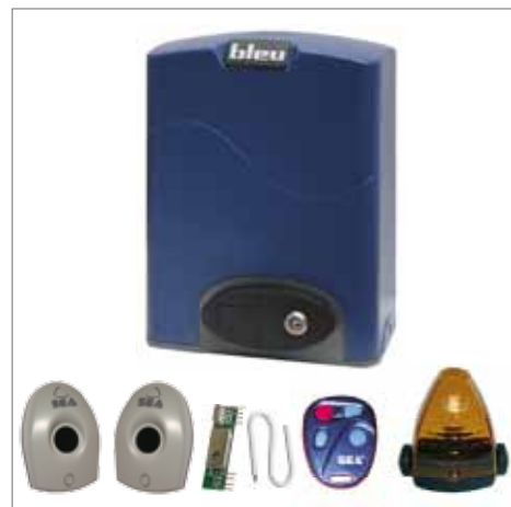
KIT B 200